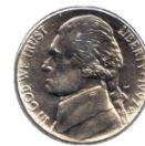
Nickel = 5 cents = $0.05