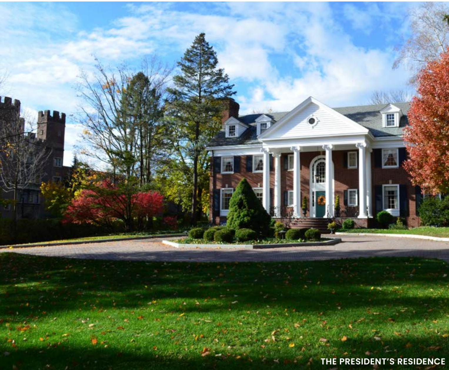
THE PRESIDENT'S RESIDENCE

WittKieffer is assisting Elmira College in this search. All applications, nominations and inquiries are invited. For fullest consideration, candidate materials should be received by March 16, 2026 .