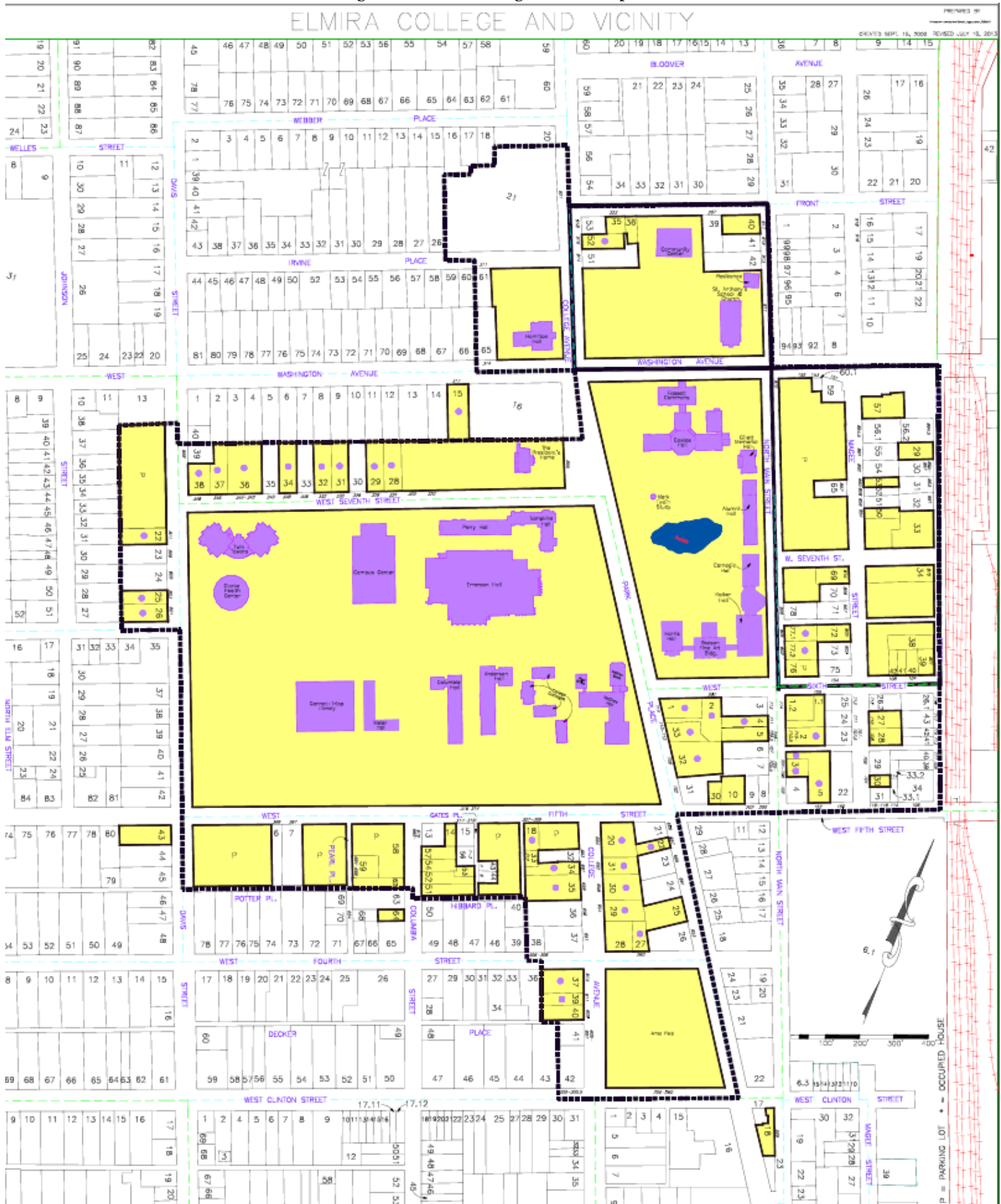
Figure 9. Elmira College Main Campus